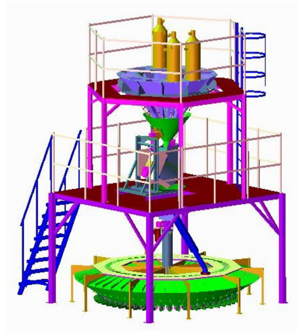
12 ingredients / 50 processing machines PelletSave system