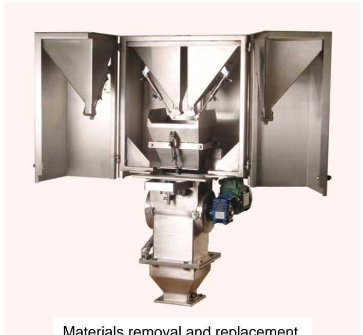
Materials removal and replacement

Removal, cleaning and new material replacement is performed while the hopper door is opened and the feeding hopper is displaced out of the mixing chamber, thus enabling it without stopping the blender's operation